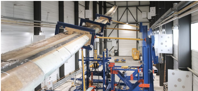
Biaxial test fatigue setup with spring element and decoupled masses

In order to achieve 1:1 excitation, Fraunhofer IWES uses artificial springs and decoupled masses to tune system frequencies. Biaxial testing with elliptical (1:1) excitation has been successfully demonstrated and is available upon request within IEC 64100-23 certification tests.